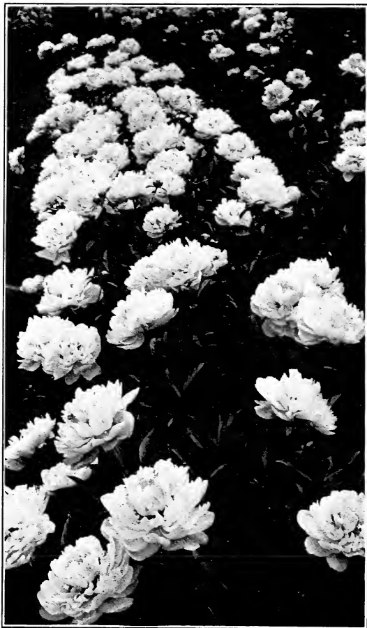
Germaine Bigot. Very profuse bloomer. One of the best newer varieties. Originator's description does not do it justice.